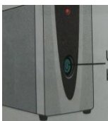
MAIN POWER SUPPLY BUTTON